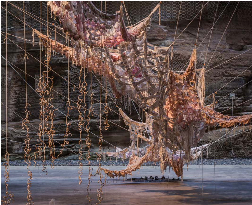
23rd Biennale of Sydney Curatorium – rīvus– 2022 Kamanchaka y La Caverna The Cutaway and Museum of Contemporary Art (MCA), Sydney, Australia

Site-specific installations made with clay, black ceramics, textiles, pigments, water, plants, photography, video, and wall-based notes. Variable dimensions.