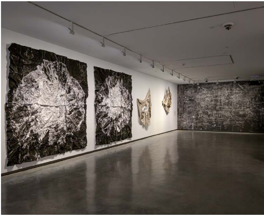
23rd Biennale of Sydney Curatorium – rīvus– 2022 Kamanchaka y La Caverna The Cutaway and Museum of Contemporary Art (MCA), Sydney, Australia

Site-specific installations made with clay, black ceramics, textiles, pigments, water, plants, photography, video, and wall-based notes. Variable dimensions.